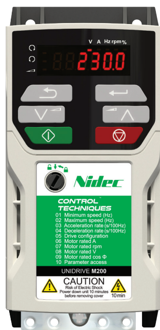
Unidrive M200 Frame Size 1