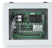
DCT in optional NEMA 4/4X weatherproof enclosure