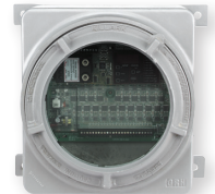
DCT in optional Explosion-proof enclosure