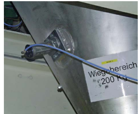
Cleaning weighing containers