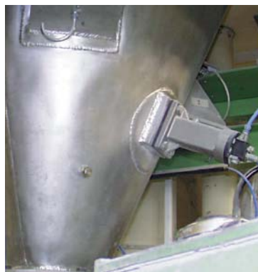
Cleaning bunker walls