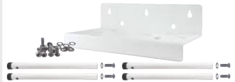
-KIT FRAME 10 DUO- for DP BIG 10 DUO CODE RB7401047