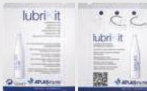
-LUBRIKIT- single-dose lubricant for housing o-ring

In compliance with the European Standard UNI EN 1717/2002: designed to prevent back-flow contamination by making all elements downstream the discharge vent to atmosphere (protection unit symbol: DC)