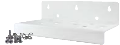
-DP BIG DUO- wall bracket CODE RB7401043