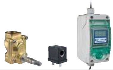
-KIT AUTO- for S models CODE RE7120024 automatic discharge kit (see pages 186-187)