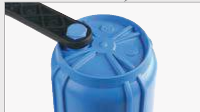
-DP BIG- spanner CODE RB7403019