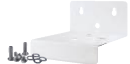
-DP BIG MONO-wall bracket CODE RB7401040