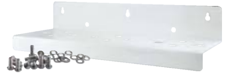
-DP BIG TRIO- wall bracket CODE RB7401044