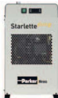
Equipped with digital controller