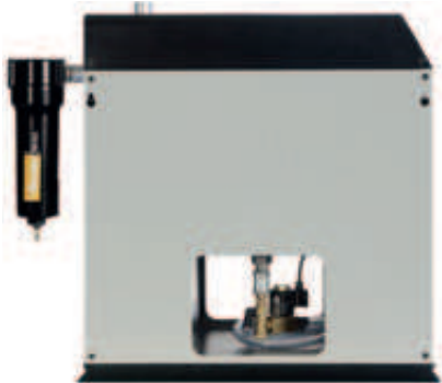
A pass-through drain niche allows easy drain access from both sides