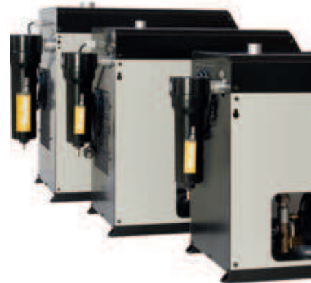
Optional pre-filter (not part of the standard scope of supply).