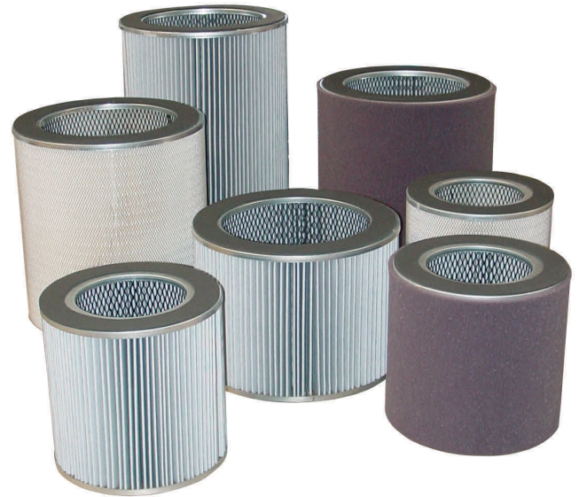
Compact & Large Elements with Metal Endcaps