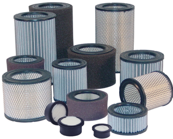
Small Elements with Molded Endcaps